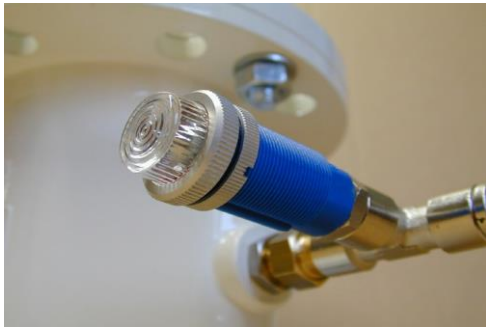
pinch valve no pressure (open)

This unit is suited for monitoring and indicating operating conditions of AKO pinch valves. When the control pressure exceeds 1.5 bar (22psi) to close the pinch valve, the visual pressure indicator will activate. When activated, a red signal will turn on (easily seen).