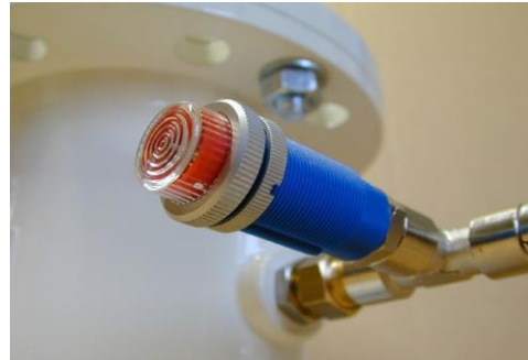
pinch valve under pressure (closed)